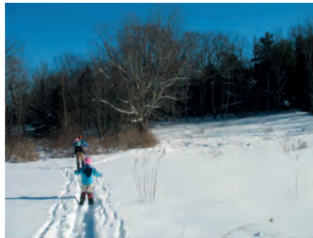
Coastal Mountains Land Trust