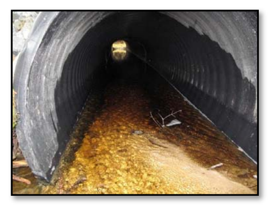
Culvert spans the entire stream width, is embedded below grade, and contains streambed material.