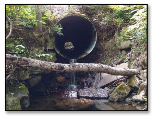
Narrow culverts become perched, preventing passage of fish and wildlife and backing up during high water events.

Culverts should be sized to handle a 25-year storm event, prevent perching and pooling, and let fish and wildlife pass normally.