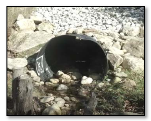
Completed culvert showing streambed material (rocks and sediment) and riprap added.