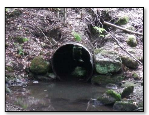
Culvert is too narrow causing pool at inlet. Water backs up during high flow, leading to erosion around culvert and washouts.