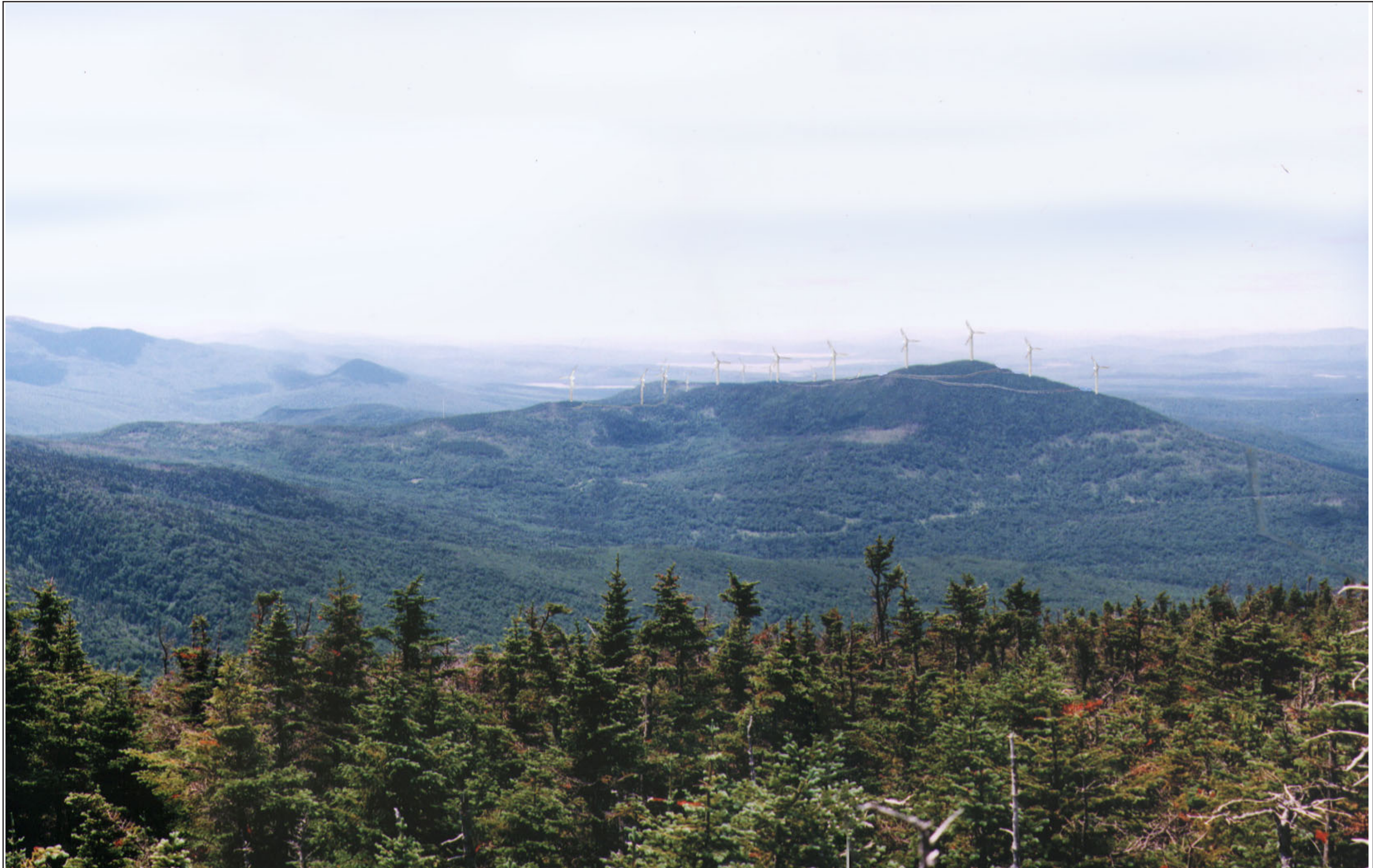
Figure 6-2c: Simulated view of the wind farm from a surveyor's cut on the northern summit of Crocker Mountain. The wind turbines will be 3.3 to 4.7 miles from this viewpoint and will occupy a 17° angle of view.

View from surveyor's cut on the northern summit of Crocker Mountain.