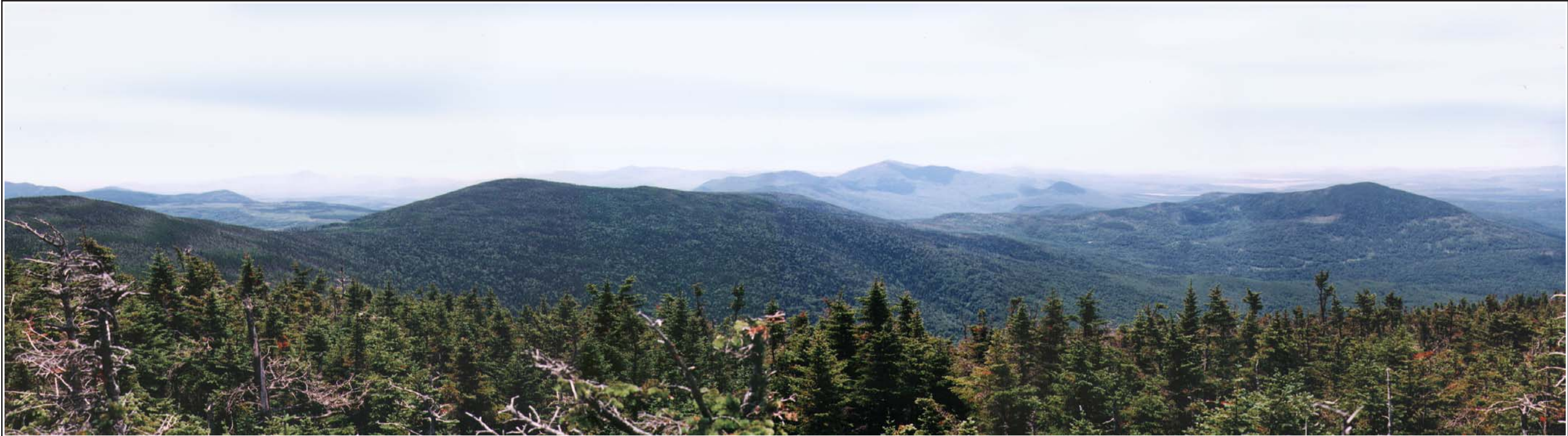
Figure 6-3a: Panoramic view from a surveyor's cut, approximately 75 yards down from the northern summit of Crocker Mountain.