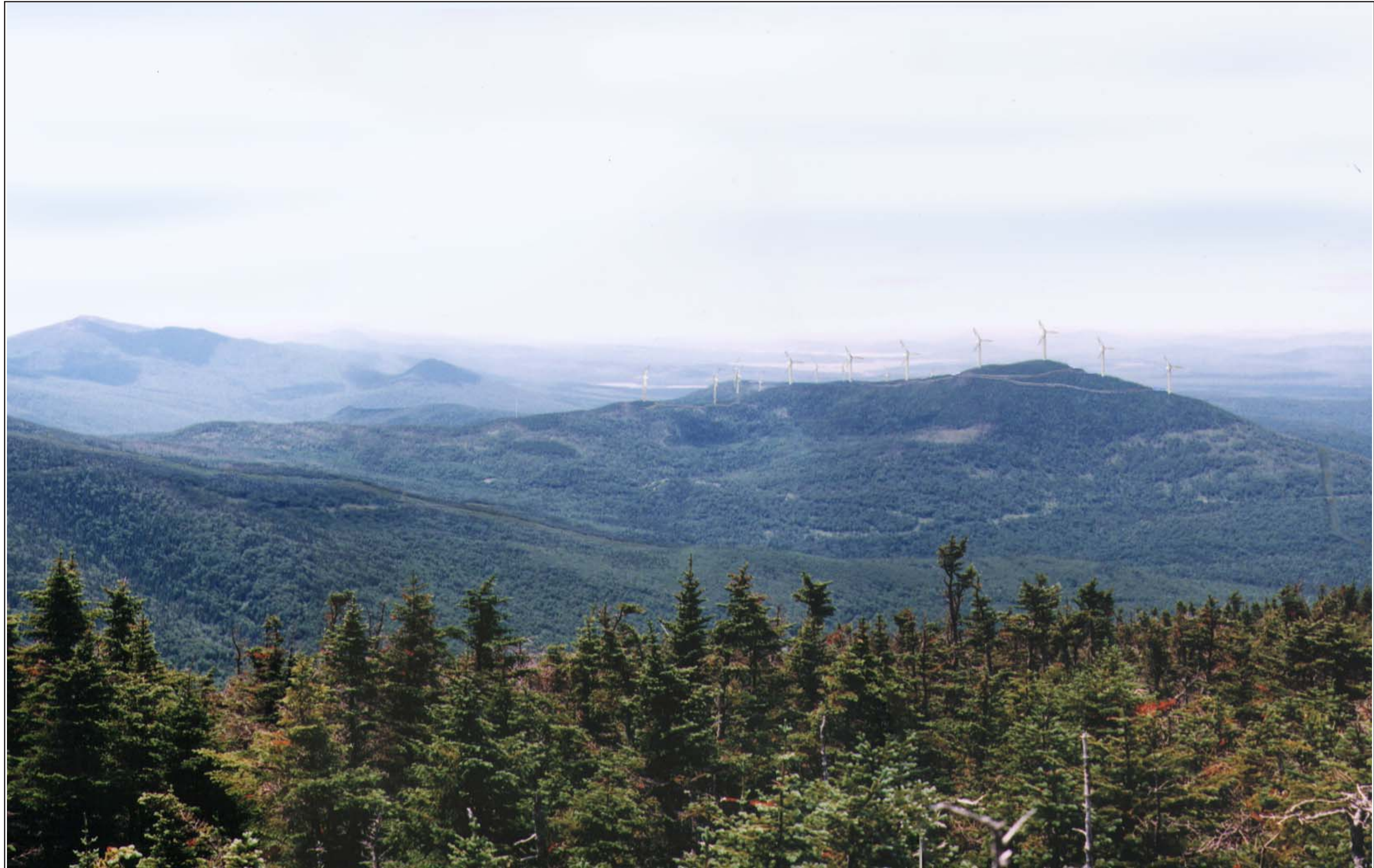
Figure 6-3d: Simulated view of wind farm on Black Nubble from surveyor's cut on the northern summit of Crocker Mountain.

View from surveyor's cut on the northern summit of Crocker Mountain