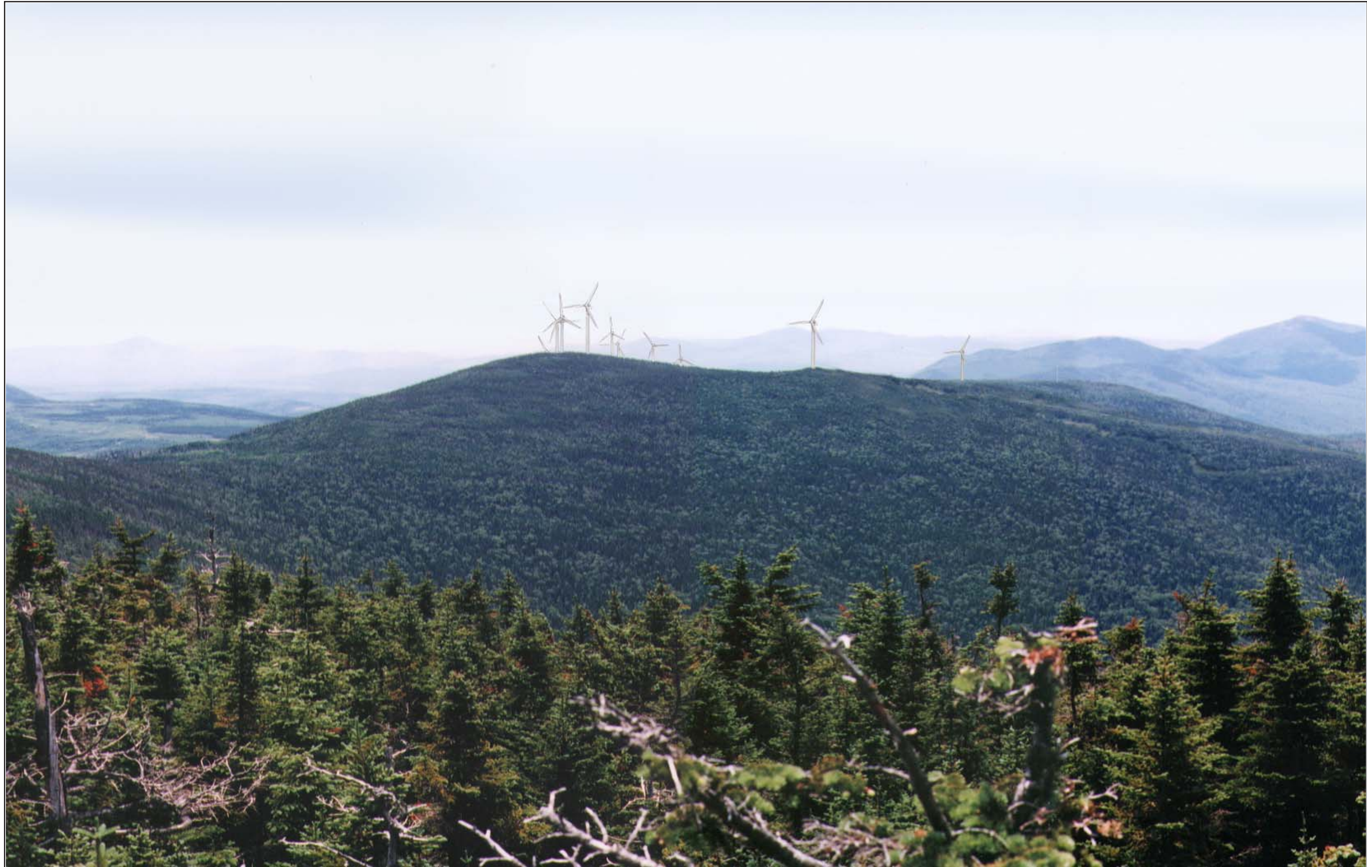
Figure 6-3c: Simulated view of the wind farm on Mount Redington from surveyor's cut on the northern summit of Crocker Mountain.

View from surveyor's cut on the northern summit of Crocker Mountain