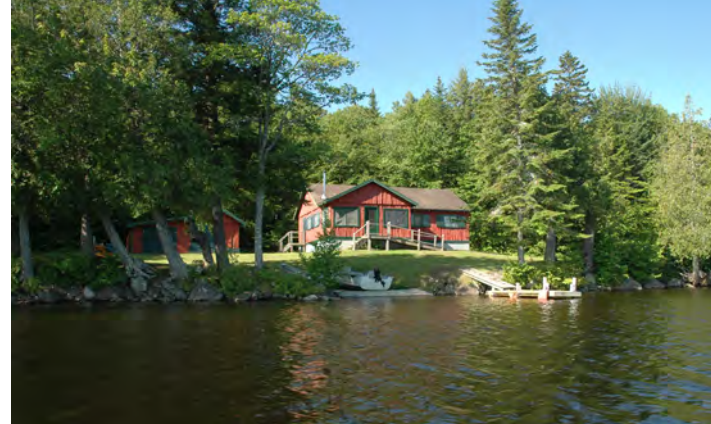
Examples of seasonal camps located on the southwest side of West Carry Pond, below Roundtop Mountain in Carrying Place Town TWP.