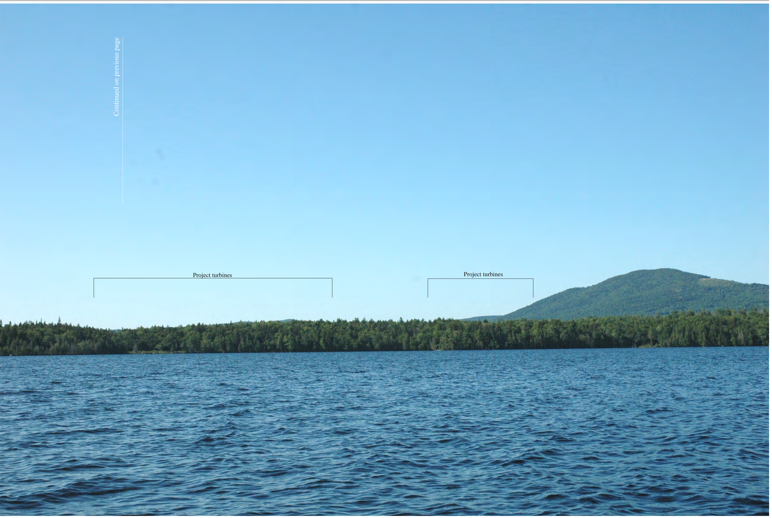
Normal view of existing conditions from West Carry Pond along the Arnold Trail looking south to southwest (showing the center portion of panorama on p. 4). The pronounced peak on the right is Stewart Mountain. Viewer should hold 11"x17" print approximately 17" from eye to replicate actual view. Photographs are from the viewpoint shown on Location Map on p. 4.