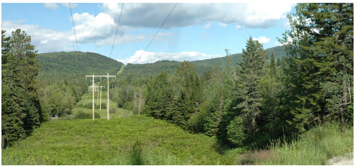
View of the existing 115 kV transmission line from Dead River Road/East Flagstaff Road in Carrabassett Valley, looking east toward Stewart Mountain (to right of clearing in photo). Long Falls Dam Road is just beyond the closest H-frame structure in photo. This is the existing transmission line that is prominently seen from several viewpoints on the Little Bigelow Mountain Ridge Segment and the Ledges Segment.