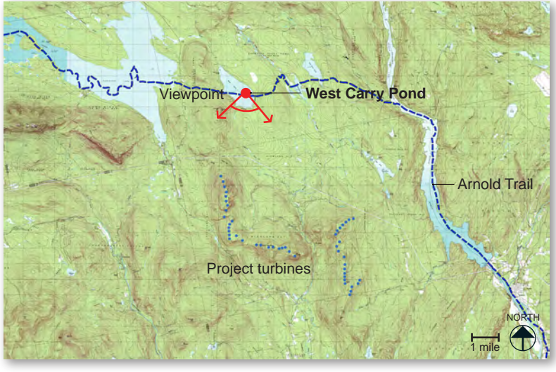
LOCATION MAP: Arnold Trail on West Carry Pond Viewpoint

This viewpoint is located on the Arnold Trail as it crosses West Carry Pond. West Carry Pond is not itself a scenic resource of state or national significance, but the Arnold Trail is. Most of the length of Arnold Trail within eight miles of the Project will not have views of the Project, except as it crosses certain water bodies, as shown on Map B in Appendix A. This viewpoint on West Carry Pond is representative of an open view of the Project from the trail as it crosses the pond.