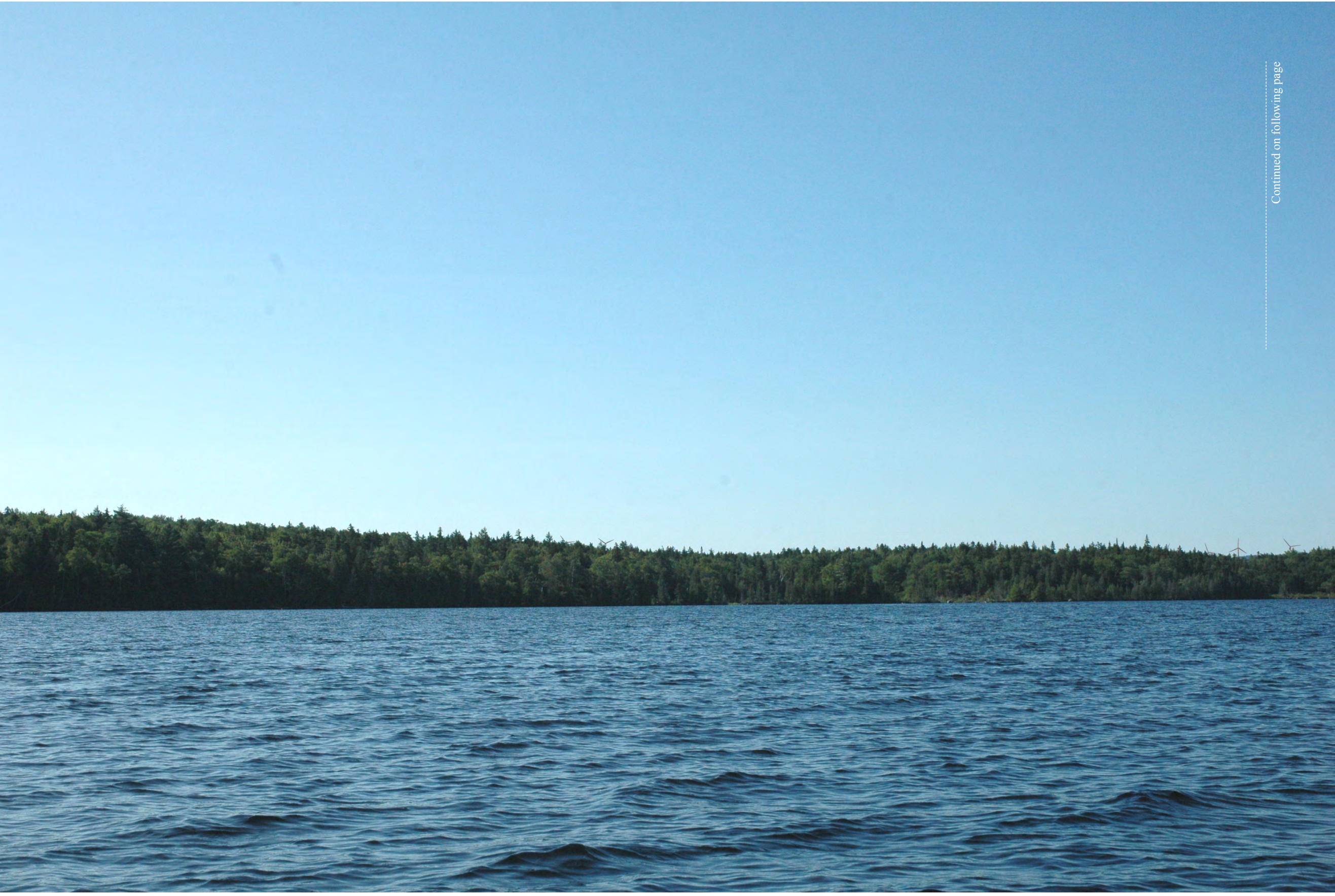
Photosimulation of the normal view from West Carry Pond along the Arnold Trail looking south to southwest toward the proposed Highland Wind Project. A total of 15 turbines would be visible from this viewpoint (as shown on both pp. 7 and 8 of this photosimulation) at distances of 4.9 to 6.6 miles away. Viewer should hold 11"x17" print approximately 17" from eye to replicate actual view. Photosimulation to right continues on p. 8. Photograph is from the viewpoint shown on Location Map on p. 4.