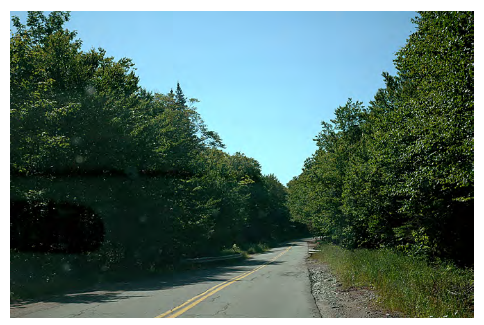
View looking north from Long Falls Dam Road, 2.1 miles north of the intersection with Old County Road. The Project access road would connect to Long Falls Dam Road near this point.