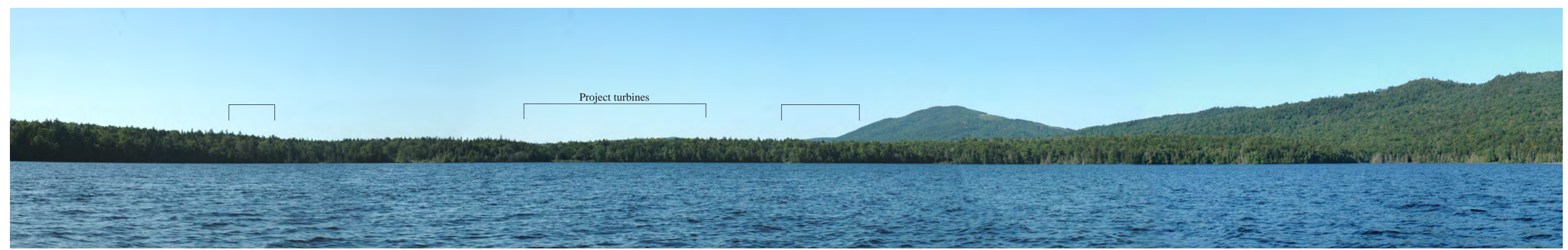
A portion of the existing panoramic view from West Carry Pond in Carrying Place Town TWP along the Arnold Trail near the tip of Arnold Point, looking south to southwest toward the proposed Highland Wind Project. Stewart Mountain is to the right of center in photograph, and to the far right, Roundtop Mountain begins to rise. Turbines would be visible at distances of 4.9 to 6.6 miles away. Panorama to the right continues below. Photographs are from the viewpoint shown on Location Map. Photographs taken on 7.10.09 at 8:24 am.