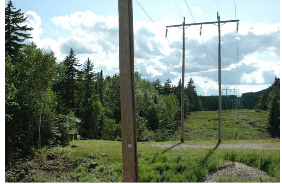
View of the existing 115 kV transmission line from Dead River Road, looking west towards Carrabassett Valley Road.