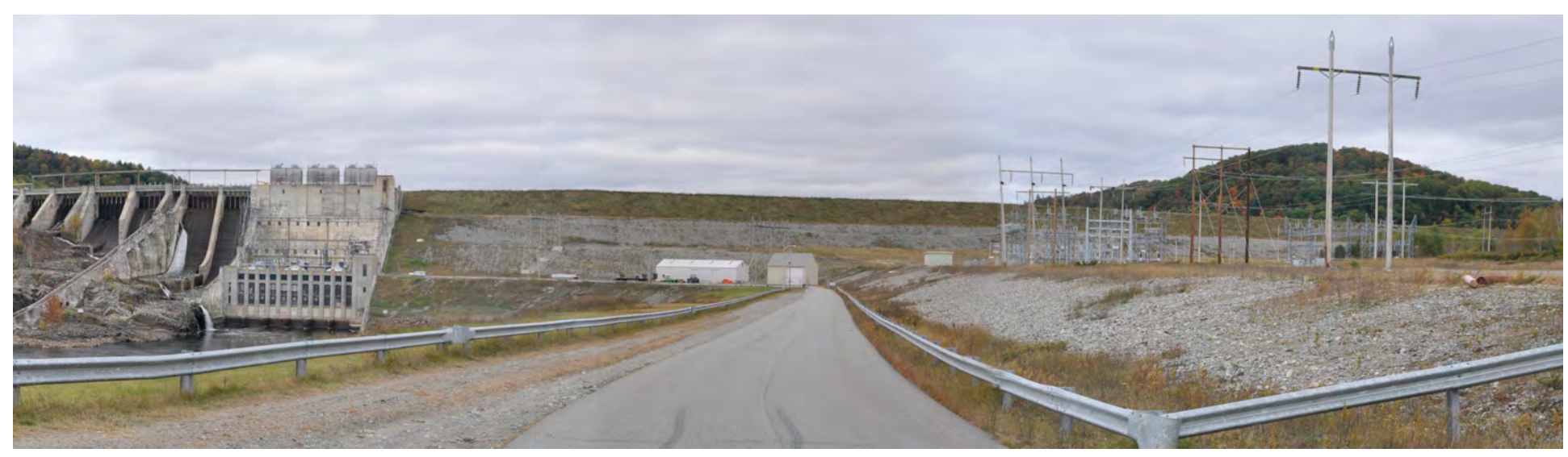
Continued panoramic view looking northwest from the access road to the Wyman Dam. The Wyman Substation is on right in photo.