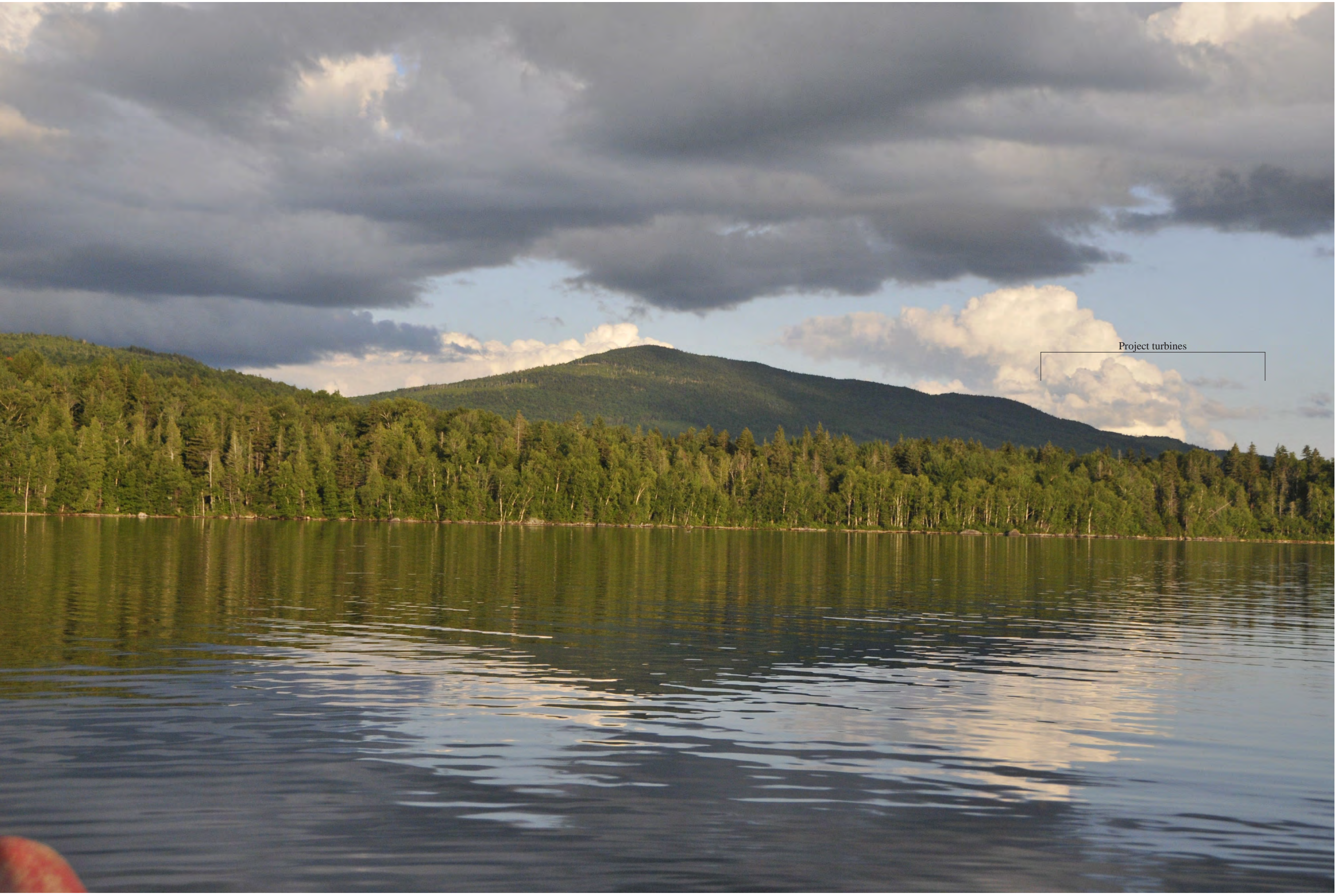
Normal view of existing conditions from Flagstaff Lake in Dead River TWP, 0.13 mile from the east shoreline, looking southeast toward Stewart Mountain. Viewer should hold 11"x17" print approximately 17" from eye to replicate actual view. Photograph is from the viewpoint shown on Location Map on p. 1.