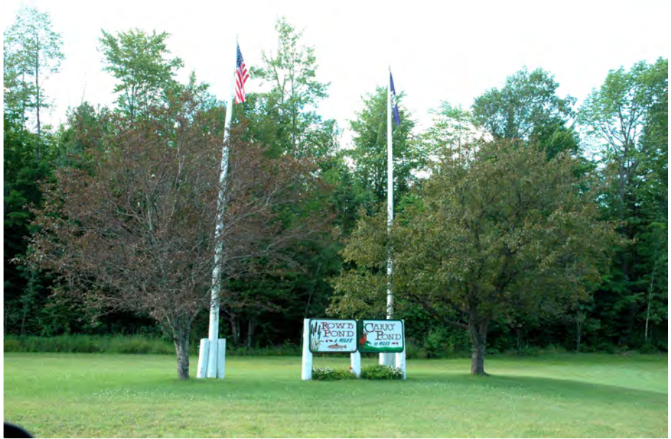
Signage at intersection of Pleasant Ridge Road, Rowe Pond Road, and Carry Pond Road. The proposed 115 kV generator lead line will cross over this intersection. The flagpoles and trees will be removed from this location.