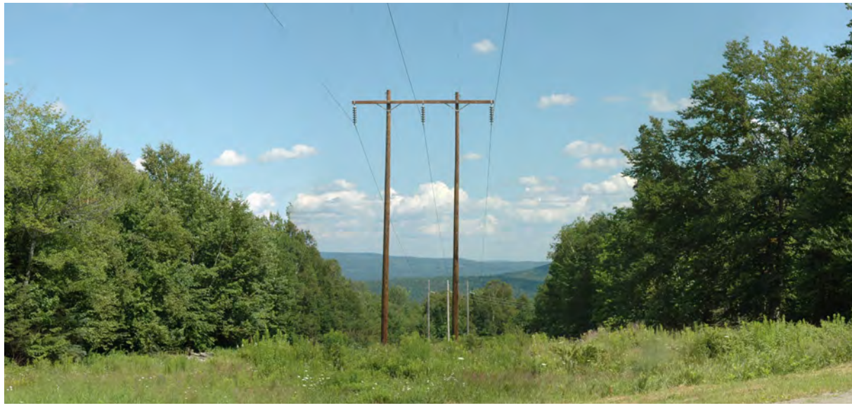
View of the existing 115 kV transmission line from Rowe Pond Road in Pleasant Ridge Plantation, looking southeast. The proposed 115 kV generator lead line will be located within a 100' wide corridor, adjacent to and south of the existing transmission line (on right in photo).