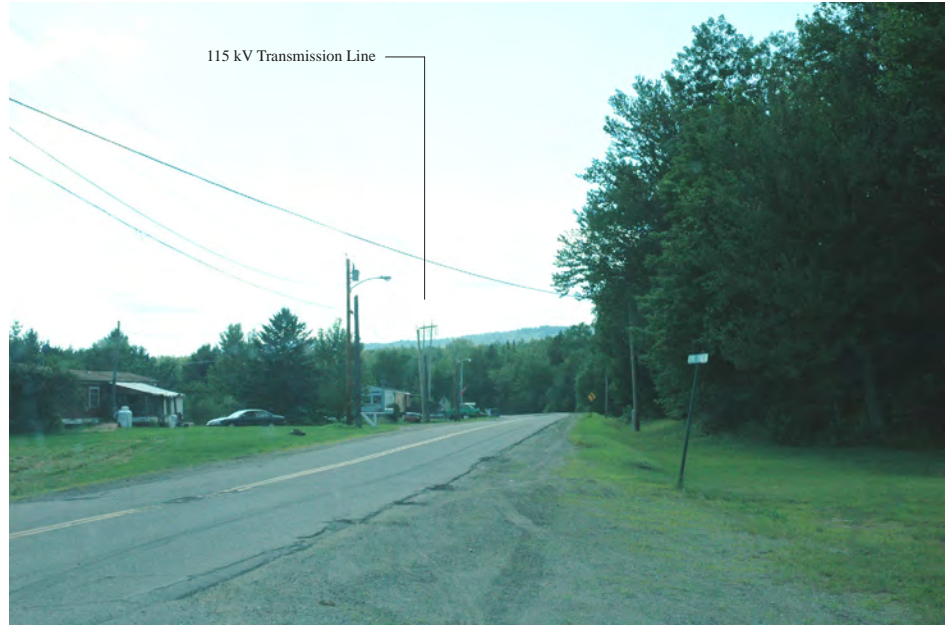
View of Rowe Pond Road, looking west toward the existing 115 kV transmission line crossing, from the intersection with Pleasant Ridge Road and Carry Pond Road. The proposed generator lead line will be located immediately overhead at this viewpoint.