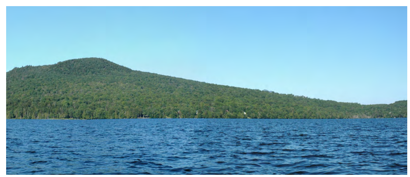
Continued panoramic view from West Carry Pond, looking south toward Roundtop Mountain. There would be no turbines in the direction of Roundtop Mountain. Seasonal camps are visible along the shoreline.

This viewpoint is located on the Arnold Trail as it crosses West Carry Pond. West Carry Pond is not itself a scenic resource of state or national significance, but the Arnold Trail is. Most of the length of Arnold Trail within eight miles of the Project will not have views of the Project, except as it crosses certain water bodies, as shown on Map B in Appendix A. This viewpoint on West Carry Pond is representative of an open view of the Project from the trail as it crosses the pond.