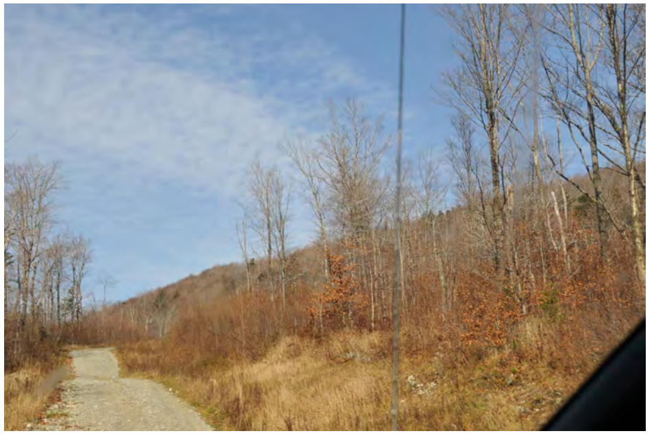
View looking northeast at an existing logging access road that will become the Project access road off Long Falls Dam Road in Highland Plantation. The Operations and Maintenance Facility will be located off this access road, approximately 450' from Long Falls Dam Road, and will be partially screened from the road by existing vegetation.