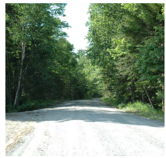
View of Dead River Road/East Flagstaff Road from the transmission line crossing, looking north.