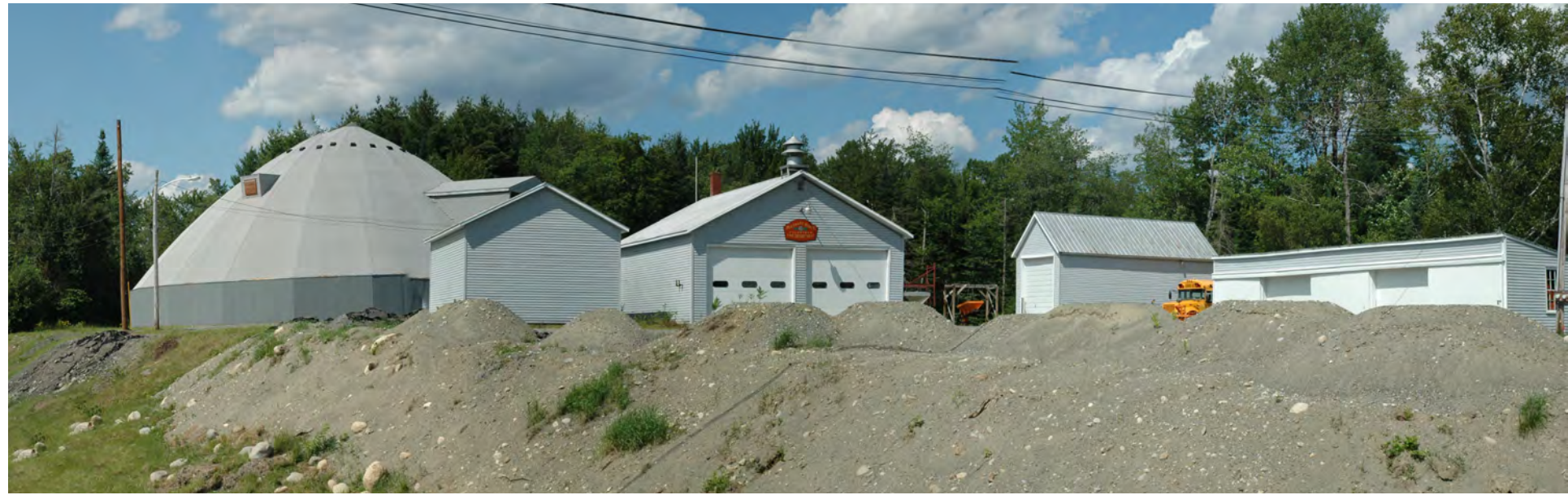
View of the Pleasant Ridge Plantation municipal facilities on Pleasant Ridge Road, 0.1 miles east of the intersection with Rowe Pond Road and Carry Pond Road, where the proposed 115 kV generator lead line crosses.