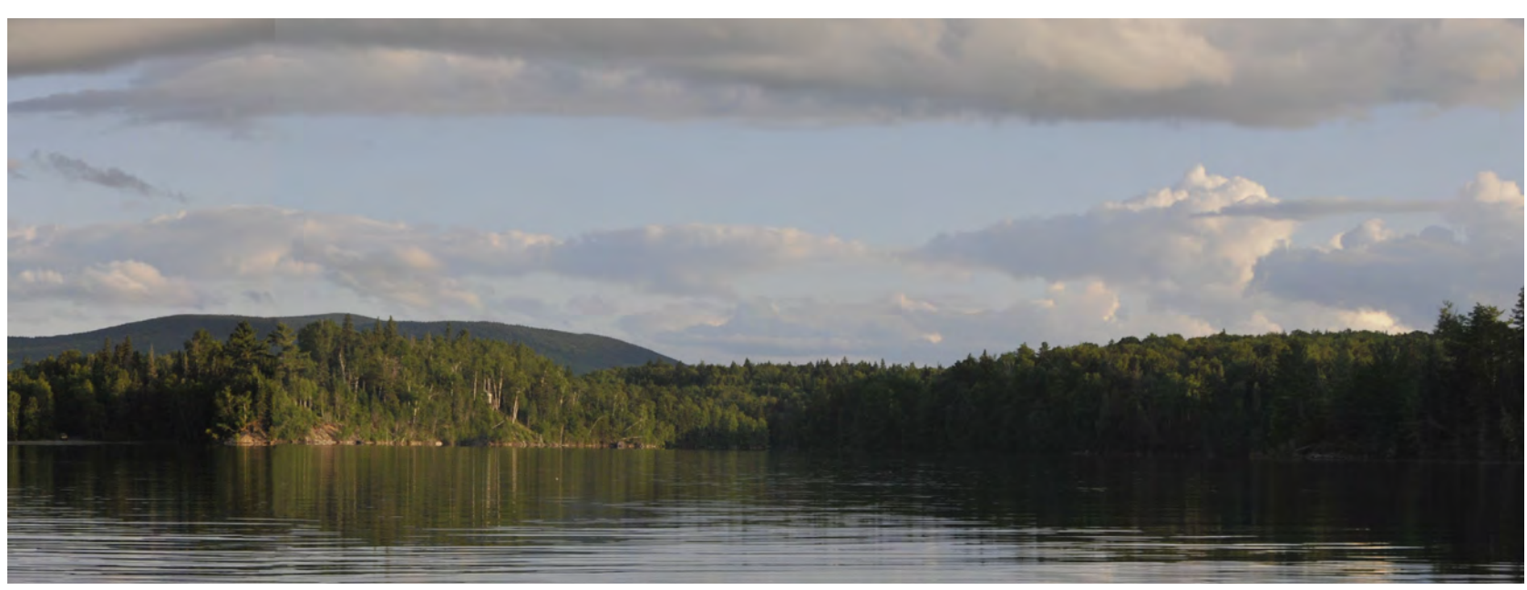
Continued existing panoramic view from Flagstaff Lake, looking south to southeast toward Poplar Mountain.

This viewpoint from Flagstaff Lake is representative of the closest views of the Project from the lake. Eight turbines would be visible from this viewpoint. From different viewpoints on Flagstaff Lake, as shown on Map B of Appendix A, up to 9+/- turbines would be visible within 8 miles. Stewart Mountain in the midground serves as a buffer between various Flagstaff Lake viewpoints and the Project.