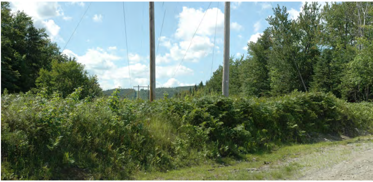
View of the existing 115 kV transmission line from Rowe Pond Road in Pleasant Ridge Plantation, looking northwest toward Stewart Mountain (to left of clearing in photo). The proposed 115 kV generator lead line will be located within a 100' wide corridor, adjacent to and south of the existing transmission line (on left of corridor in photo).