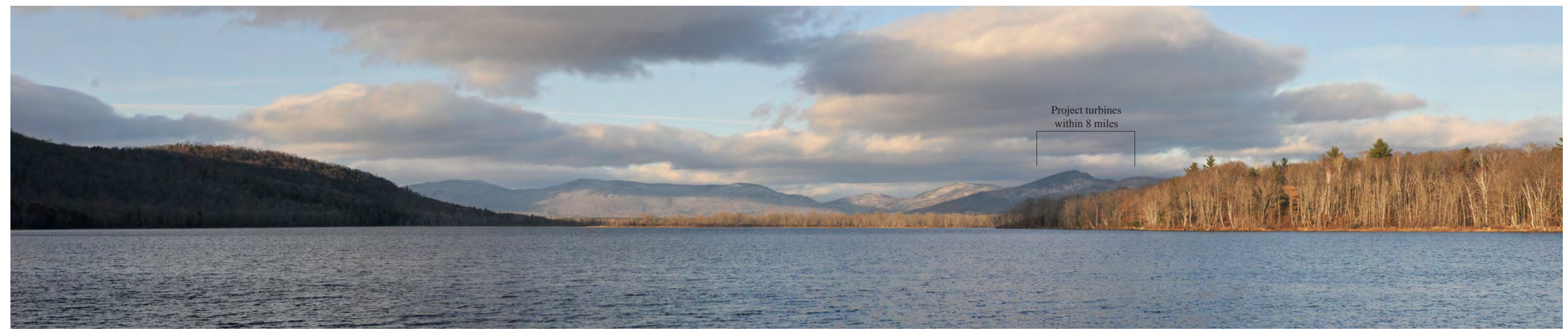
Panoramic view from the south end of Gilman Pond in New Portland. View is looking north toward Witham Mountain, Bald Mountain, Burnt Hill, and Briggs Hill. Photographs are from the viewpoint shown on Location Map. Photographs taken on 11.29.09 at 3:45 pm.