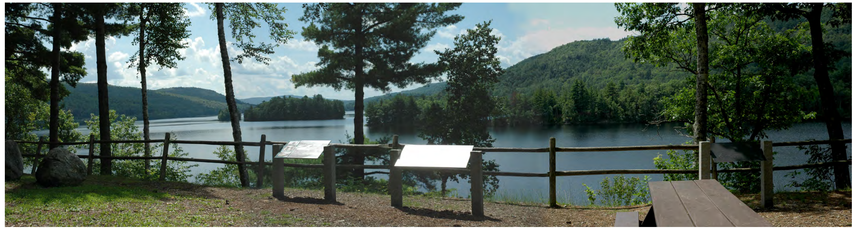
Panoramic view looking southwest from the Wyman Lake Scenic Turnout off Route 201, 0.2 miles south of the Moscow/Caratunk town line. The Project will not be visible from this viewpoint.