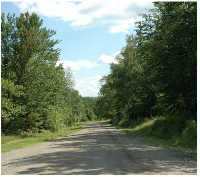
View of Rowe Pond Road within the existing transmission line, looking south. The proposed corridor will be on the far side.