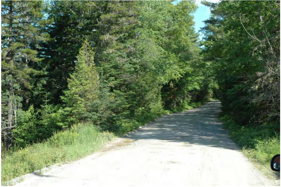
View of Dead River Road/East Flagstaff Road from the transmission line crossing, looking south.