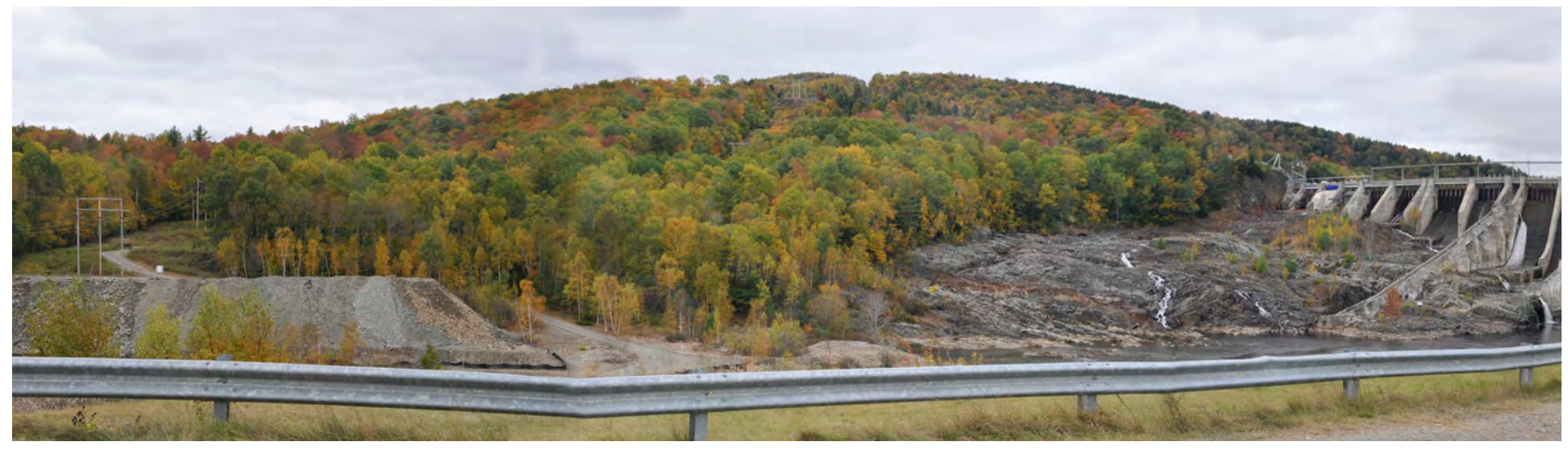
Panoramic view looking west at the existing 115 kV transmission line from the access road to the Wyman Dam in Moscow. The current capacity of the transmission lines on this section will be increased by CMP within the existing transmission corridor to accommodate the energy that the Project will deliver to the Wyman Substation. It is likely that, when finally engineered, new transmission structures on either side of the Kennebec River crossing will be larger than the existing structures. The Wyman Substation is seen in the bottom photograph.