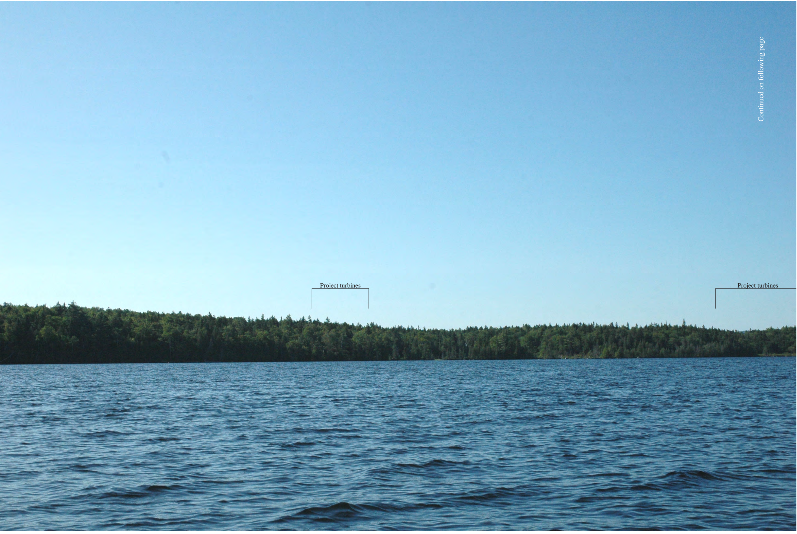
Normal view of existing conditions from West Carry Pond along the Arnold Trail looking south to southwest (showing the left portion of panorama on p. 4). Viewer should hold 11"x17" print approximately 17" from eye to replicate actual view. Panorama to right continues on p. 6. Photographs are from the viewpoint shown on Location Map on p. 4.