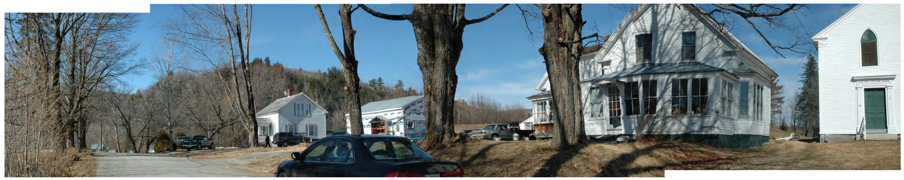
Panoramic view looking west from the Bingham Free Meetinghouse on Old Church Street. The northern end of Old Bluff Mountain is visible in the background of photo.

Panoramic view looking north toward the Bingham Free Meetinghouse on the corner of Old Church Street and Route 201 (Main Street) in Bingham. This structure is on the National Register of Historic Places. The Project will not be visible from this viewpoint.