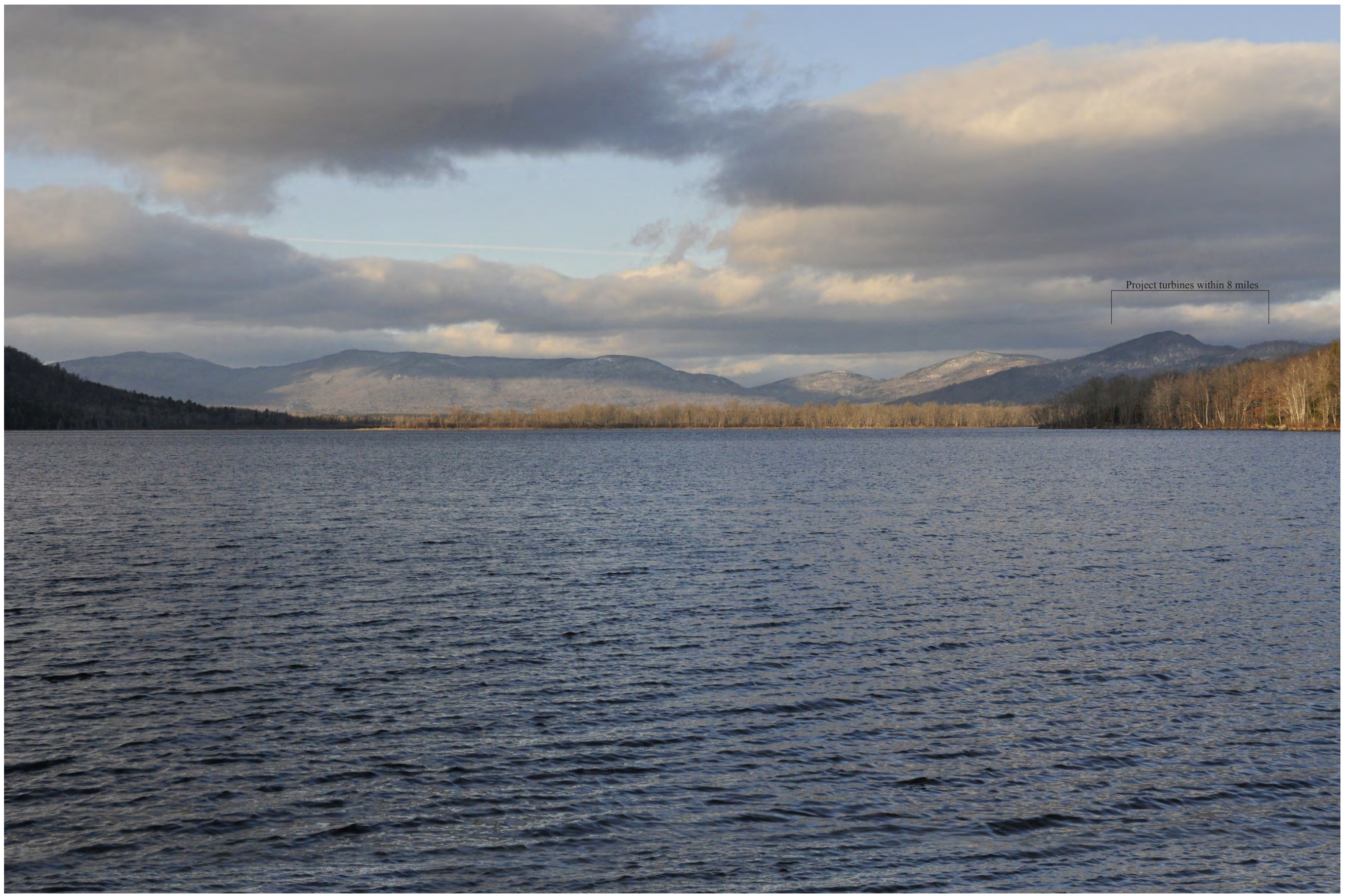
Normal view of existing conditions from the southern end of Gilman Pond in New Portland, looking north. Viewer should hold 11"x17" print approximately 17" from eye to replicate actual view. Photograph is from the viewpoint shown on Location Map on p. 9.