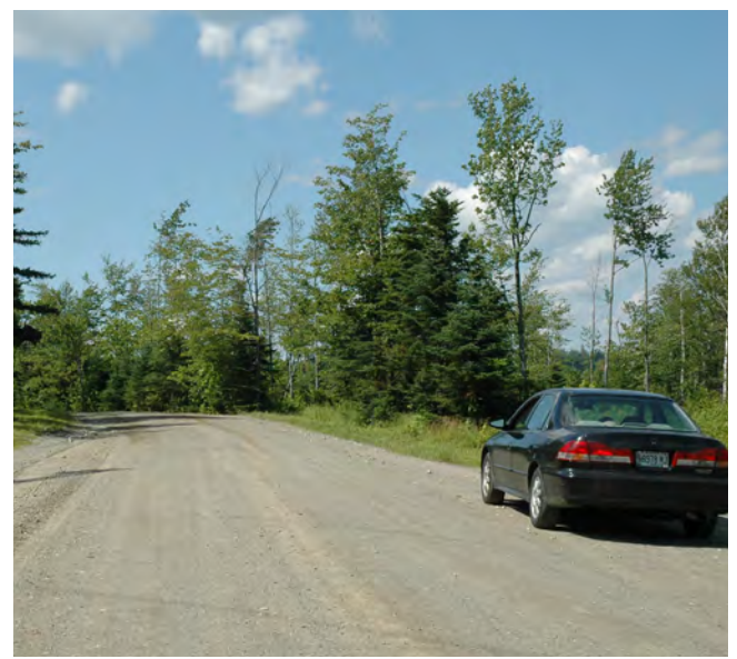
View of Rowe Pond Road within the existing transmission line, looking north.