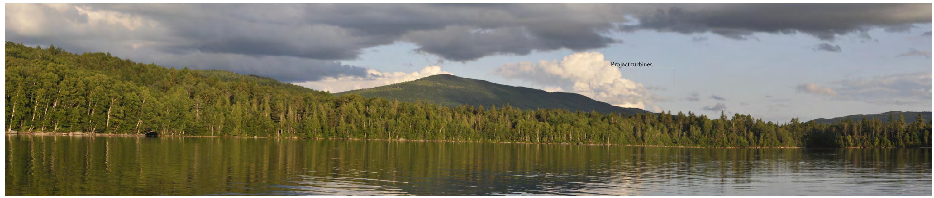
A portion of the existing panoramic view from Flagstaff Lake in Dead River TWP, 0.13 mile from the east shoreline, looking east to southeast toward Stewart Mountain. Panorama to the right continues below. Photographs are from the viewpoint shown on Location Map. Photographs taken 7.25.09 at 7:13 pm.