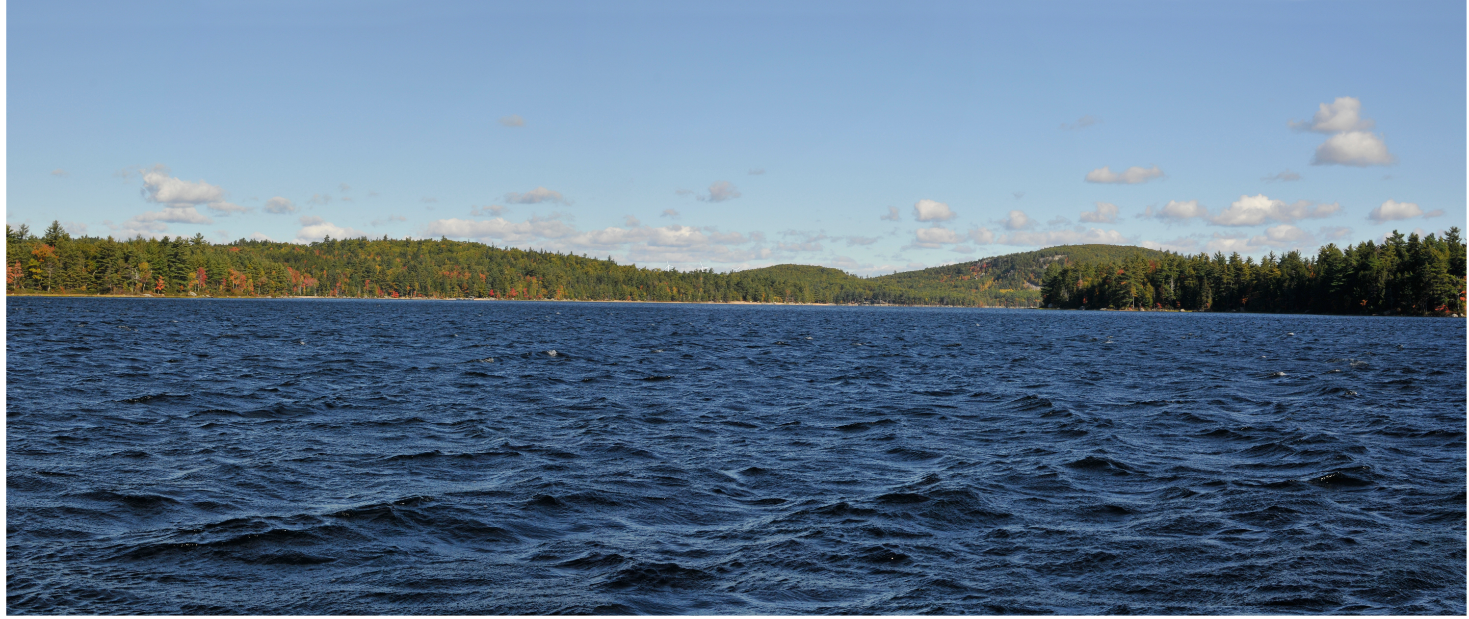
Photosimulation 5A: Panoramic view looking north from Donnell Pond in T9 SD toward the proposed Bull Hill Wind Project. This viewpoint is approximately 225' north of Cape Rosier. Portions of blades from four turbines will be visible within 8 miles of this viewpoint.