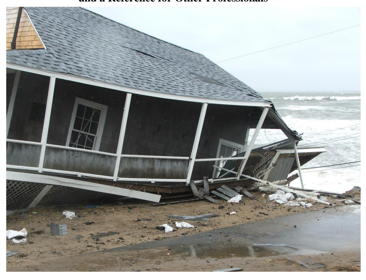
Patriot's Day Flood 2007 Saco (Camp Ellis) Maine

A Resource Tool for Land Use Certification in the Code Enforcement Officer Training and Certification Program and a Reference for Other Professionals